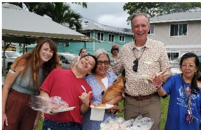
Great Burgers, corn on cobb, and yummy cupcakes!