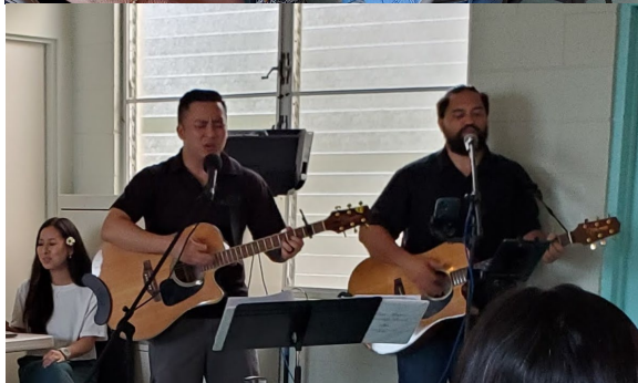
(Pics from first Pā'ina Night)